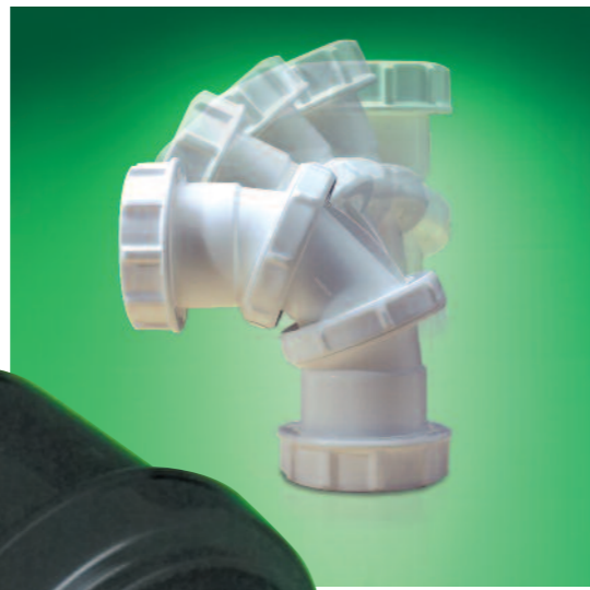
0-90° ADJUSTABLE BEND

Make your life easier with the FloPlast 0-90° adjustable waste bend, the one fitting that will get you out of a tight spot.