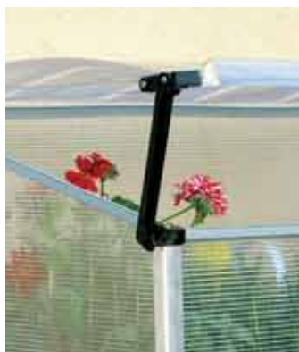
Half Open Ventilation & humidity control