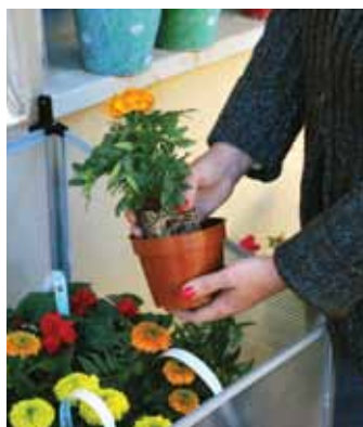
Open No Lid Potting inside