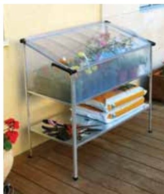
Closed Frosts & pests protection