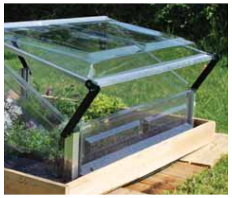
Half open Ventilation & humidity control