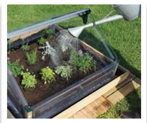
Without lid Irrigation & cultivation