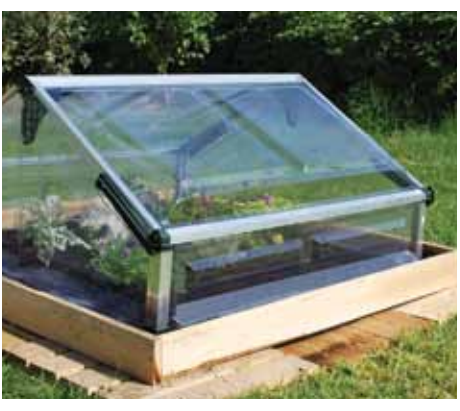
Closed Frosts & pests protection