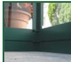
Built in base section