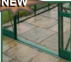
Ground level access