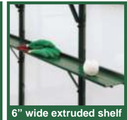
6" wide extruded shelf