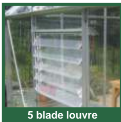
5 blade louvre