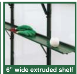
6" wide extruded shelf