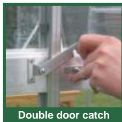
Double door catch